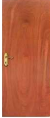
Gorjon Light Mahogany Lacquered (IMC-2)