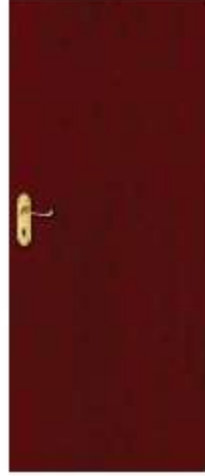
Champ Dark Mahogany Lacquered (IMC-1)