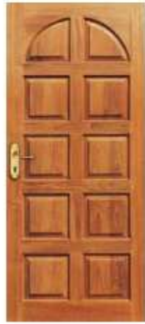
CODE -SD 005