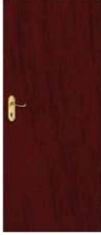
Burma Teak Dark Mahogany Lacquered (IMC-1)