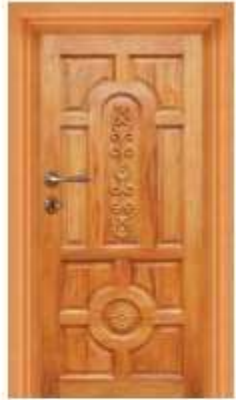
Complete Door Unit