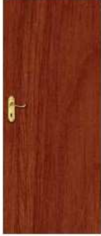
Crown Teak Light Mahogany Lacquered (IMC-3)