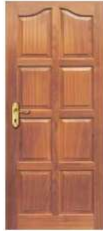
CODE -SD 004