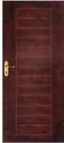
CODE -SCD 020