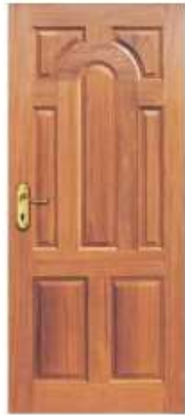
CODE -SD 006