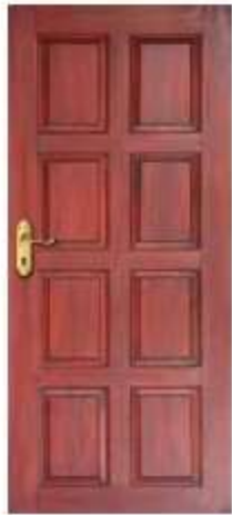
CODE -SCD 019