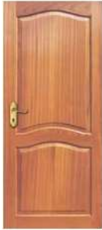
CODE -SD 003