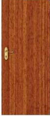
Super Teak Light Mahogany Medium (IMC-2)