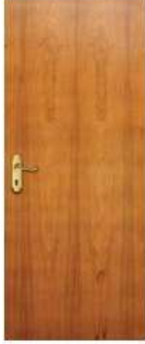
Red Oak UV Lacquered