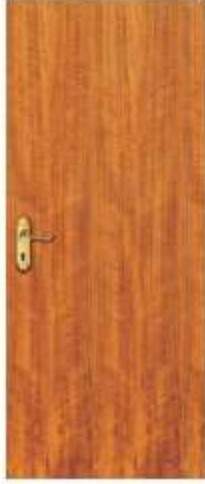
CHAMP REGULAR Clear Lacquered