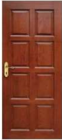
CODE -SD 001