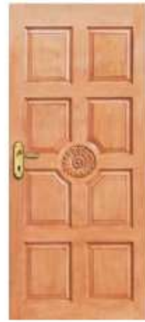
CODE -SD 008