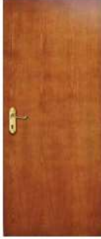
Burma Teak UV Lacquered