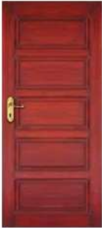
CODE -SCD 018