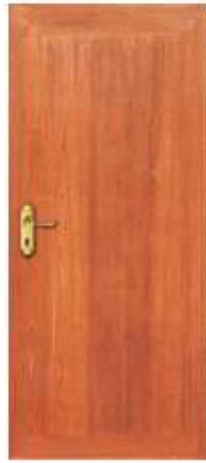
CODE -SD 007