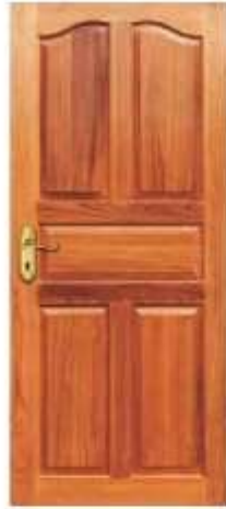
CODE -SD 002